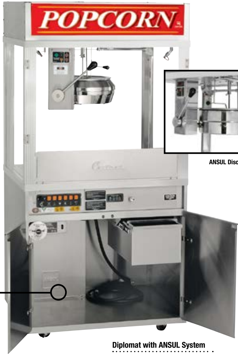
ANSUL Discharge Nozzles