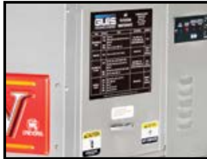
Close-up of Ventless Feature