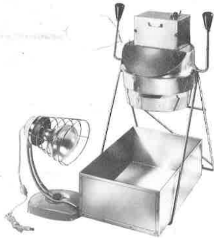
CRETORS TIP TOP

We left off the plastic, the lights, the cabinet, the doors, the shelves, the color, and lots of cost.