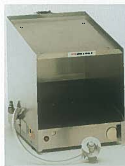
Bag-in-Box (BIB) Oil Pump