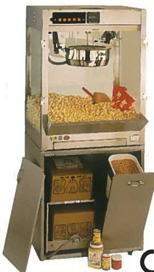
EMR16CP & EMRB SS & 7900 Pump

Pumps are sold separately and can be shipped inside a base unit or with a counter model as a second piece.