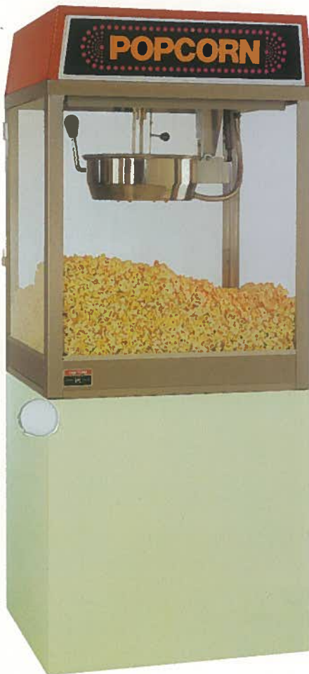
MR16CP & MRDB