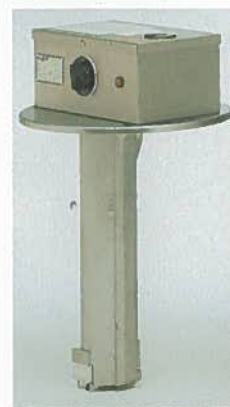
Automatic Oil Pump