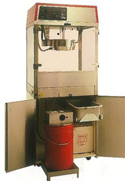
MR16CP & MRDB & 7700 Pump

This base will accommodate Merchant and Profiteer. DIMENSIONS: 22"D x 28"W x 29.5"T NET WEIGHT: 64 lbs., Shipping Weight: 75 lbs. SHPG. CARTON: 27.5"D x 33"W x 32.75"T; Cube 17.2 Pail step not included with the MRDB or MREB.