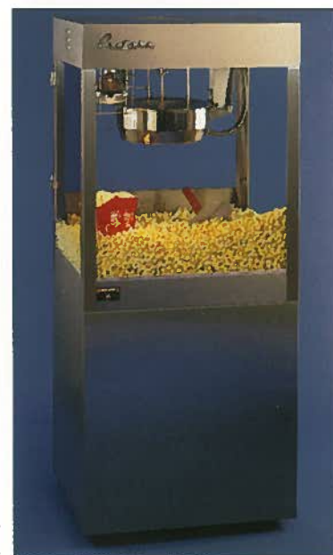
EMR16CP & EMRB SS