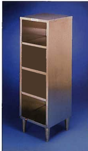
7908A BRW4 Vertical model

SHIPG. CRATE: 21"D x 21"W x 51"T; Cube: 13.02 cu. ft.