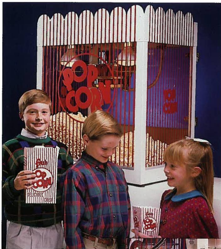
PT14C Popcorn Box Profiteer

The Popcorn Box Profiteer combines the latest in technology for efficiency and economy with a whimsical touch. Selling popcorn has never been so much fun!