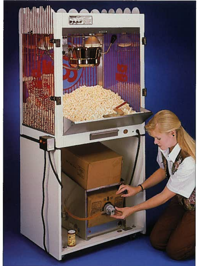
7900 Bag in the Box Pump