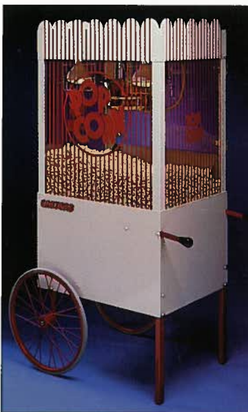
Two wheel wagon base A2WBL- White and Red