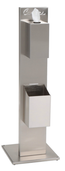
Hand Wipe Floor Stand