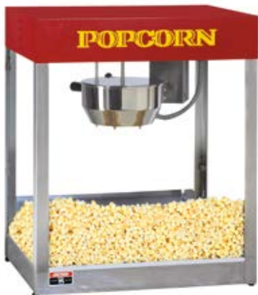
Profiteer Red Top