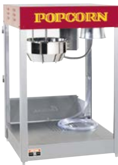
T-3000 Plus Red Top