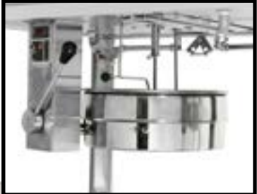
ANSUL Discharge Nozzles