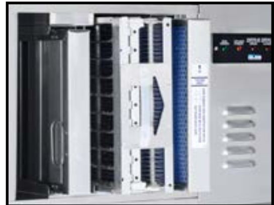
Ventless Hood System