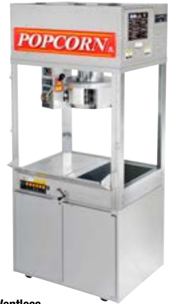
Mach 5 Ventless