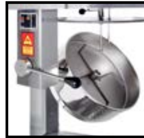
Mach 5 Kettle