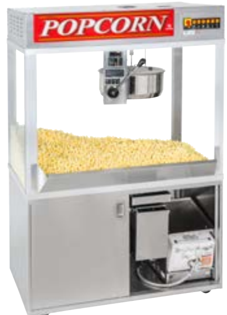
Mach 5 Floor Model (4 ft)