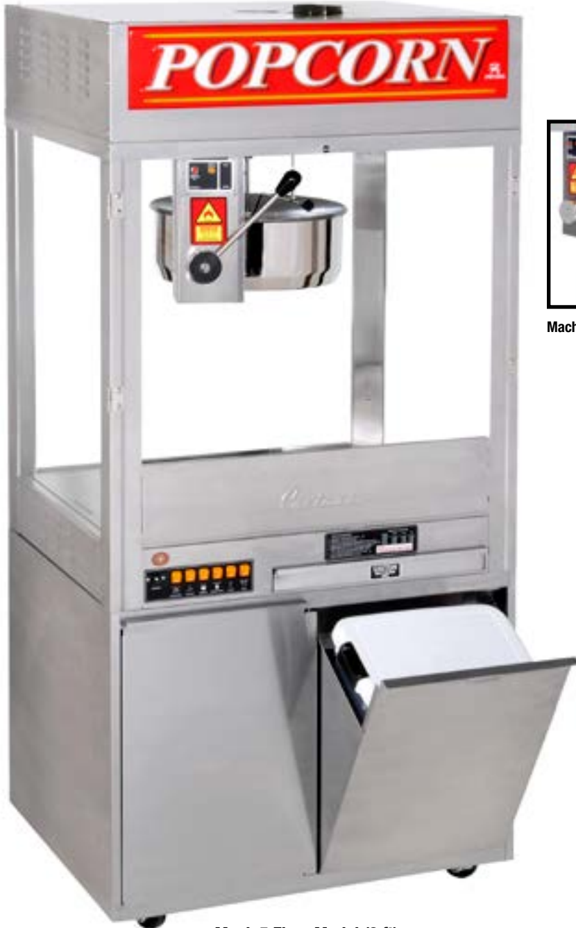
Mach 5 Floor Model (3 ft)

you to upgrade to a larger kettle. The large 16" diameter kettle allows for maximum expansion for today's high expansion corn hybrids. Need more volume? Turn your 32 oz kettle into a 48 oz or 60 oz by simply changing the heat elements. The current MACH 5 is the fifth generation of our popular popper, coupling Cretors expertise and all the benefits of modern manufacturing.