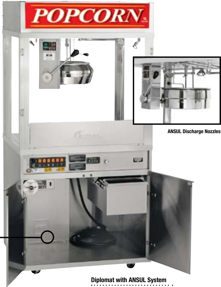
ANSUL Discharge Nozzles