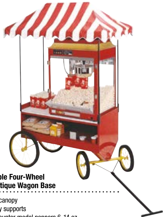
Steerable Four-Wheel Red Antique Wagon Base