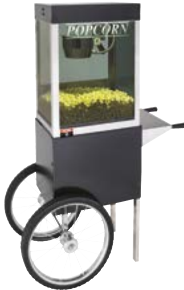
Black Two-Wheel Wagon