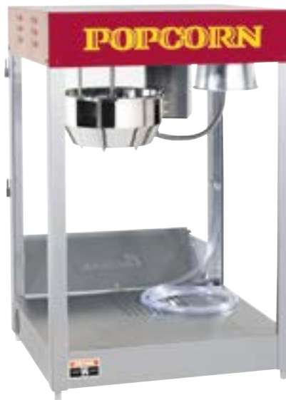
T-3000 Plus Red Top