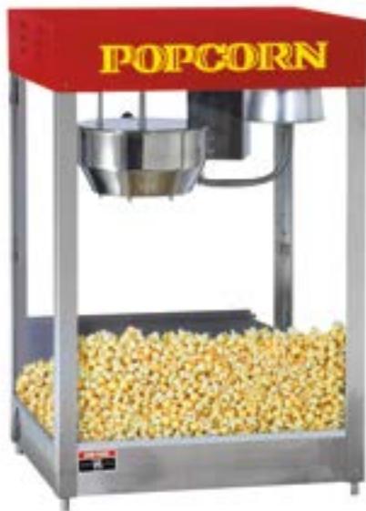
T-3000 Red Top

With an almost 50% increase in popcorn production over the T-2000, the T-3000 is the gateway in the Cretors small popper line to our large popcorn machines. The T-3000 Plus and the Profiteer are the only small concession poppers that are equipped for automatic oil pumps. The T-3000 Plus also has the hot air Cornditioner system, providing large machine capabilities in a small machine footprint.