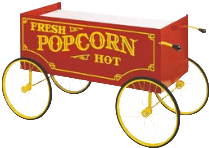
Standard Four-Wheel Red Antique Wagon Base