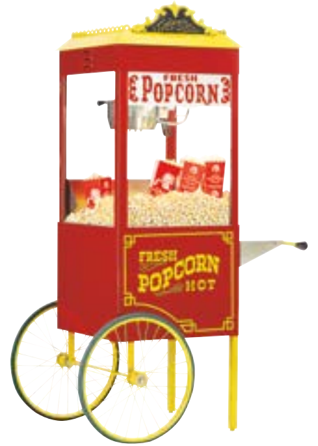
Red Two-Wheel Wagon